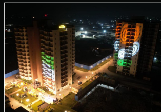
SPLENDOR GRANDE Panipat