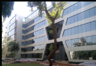
CYBER PARK Gurugram