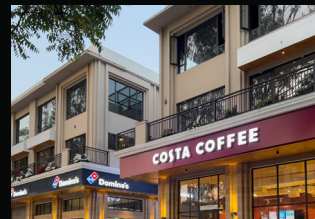
ADDRESS ONE Dehradun