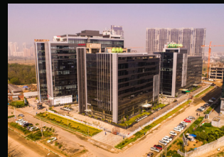
SPECTRUM ONE Gurugram