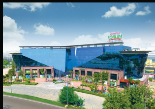
SPLENDOR FORUM New Delhi

Disclaimer: ONYX BLUE IS REFERRED AS ONYX IN THE DOCUMENT FOR THE EASE OF COMMUNICATION, THE PROJECT NAME AS PER RERA IS ONYX BLUE. the contents published herein shall not be treated as any sort of invitation, legal offer or promise or representation from the Developer. All images are artistic impressions. Layout of the Project, Map/Design and shape of the building, Blocks, Towers are tentative and the specifications, drawings, amenities, compounds, multiple buildings, facilities, parameters etc. shown in this advertisement are subject to change. The existing sanctioned plans of the Project are in the process of being revised/ changed. The intending purchaser must review the Project details, revised sanctioned plans and approvals, drafts of the booking application and agreement prescribed by the Developer for detailed terms and conditions. The intending purchaser must make his/her own assessments and independent inspection, and shall not rely on any date or the image in this advertisement."