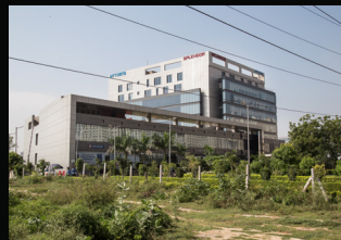
SPLENDOR TRADE TOWER Gurugram