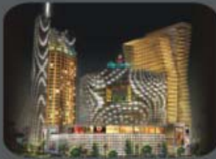
Logix City Center