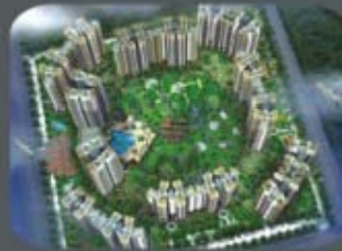
Logix Blossom County